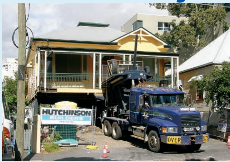
Hutchies has joined forces with the CFMEU and other contractors and suppliers to create a home for the Youngcare charity for free.

EARLIER this year, Hutchies was invited by the CFMEU to help create a home for Young-care, a charity whose mission is to provide a dignified and relevant lifestyle for young people requiring nursing care.