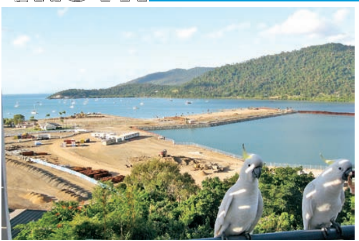
Bird's eye view of Hutchies' site office as Airlie Beach's Muddy Bay is being transformed into the Port of Airlie – destined to be Queensland's new gateway to the Great Barrier Reef.