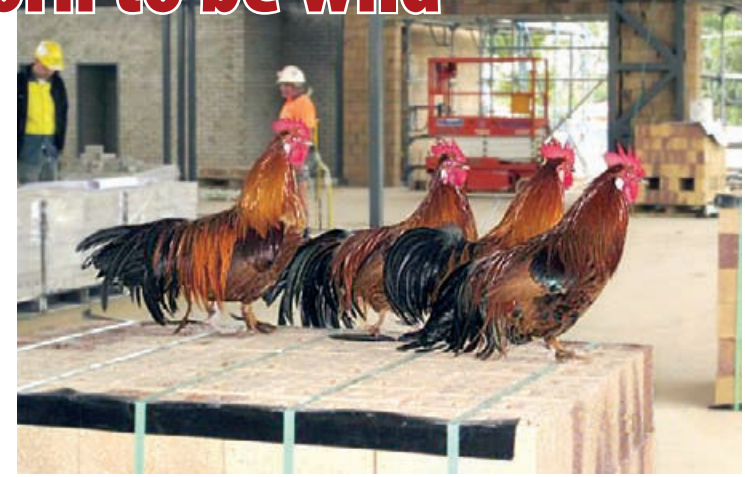
These four roosters had plenty to crow about when they moved onto Hutchies' Murrumba Downs Tavern construction site.

One rooster was put down when it attacked a council worker who