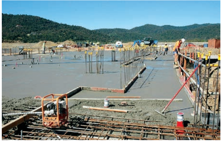
Port of Airlie's first ground floor suspended deck was poured on July 3.

140-bed luxury hotel, 365 one to five-storey residential apartments across eight buildings, 15 exclusive residential ocean front home blocks and 4,000m<sup>2</sup> of retail space for shops and restaurants.